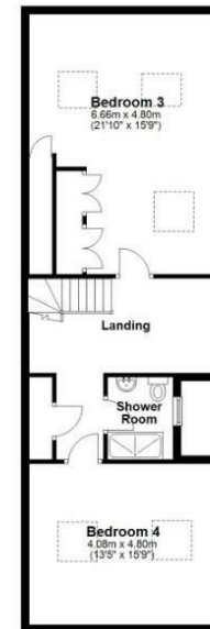
First Floor Approx. 85.0 sq. metres (915.3 sq. feet)

Total area: approx. 247.9 sq. metres (2668.7 sq. feet)